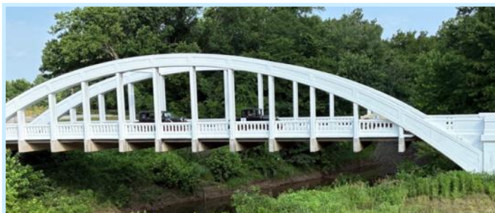
Rainbow Bridge – Baxter Springs is located on the former Route 66. Built in 1923 this is the last remaining drivable Marsh Arch Bridge on the entire length of Route 66.