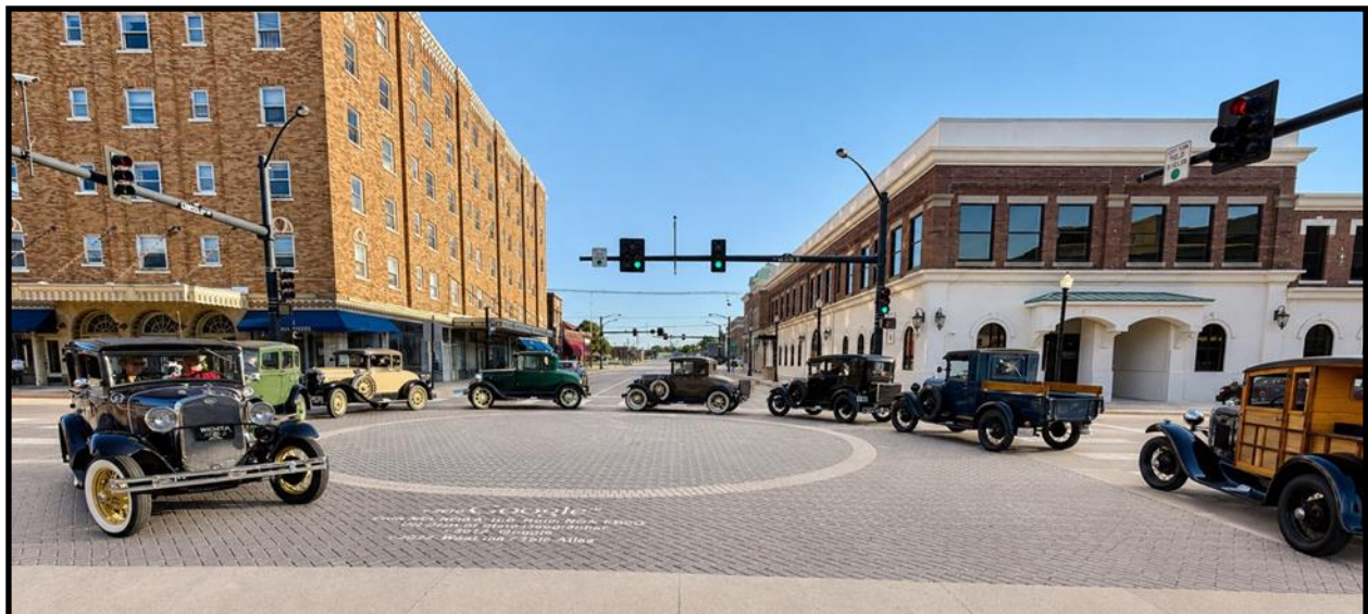
Traveling in a Model A to the Center of Google Earth - It does not get any better! Ahooga