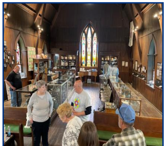
Girard, Kansas history museum in former St. John's Church