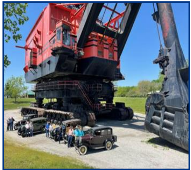
Wichita A's Photo op with Big Brutus

With the sun shining and the opportunity for a Model A drive, our group pointed the cars in the direction of West Mineral, Kansas and home to BIG BRUTUS. Big Brutus is the nickname for the Bucyrus-Erie model 1850-B electric shovel used for strip mining. At a height of 160 feet, width of 58 feet, length of 79.5 feet, weighing in at 9,300,000 lbs. and painted bright orange, Big Brutus filled the windshield of our Model A's from several miles away. Started up in 1963 Big Brutus was active until 1974 when it was considered uneconomical. The Big Brutus museum personnel graciously allowed our group of Model A's to park the cars next to Big Brutus for a photo that gave a unique perspective on the machine's size.