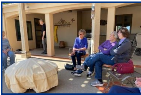
Listening to music on the patio.