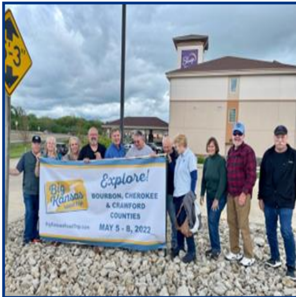
BKRT 2022 Group Photo

"It was a gray, gloomy, drizzle filled morning as the vintage Ford cars arrived at the departure point." Like the start of an exciting mystery novel, the fourth annual Big Kansas Road Trip began shrouded in the mystique of low hanging clouds, light rain and mystery of places and people to be discovered in southeast Kansas. Destination for the 2022 Big Kansas Road Trip (BKRT) was Bourbon, Cherokee and Crawford counties. Five Model A's, one modern car and twelve individuals accepted the invitation to discover the hidden secrets of the three counties near our Oklahoma/Missouri boarder.