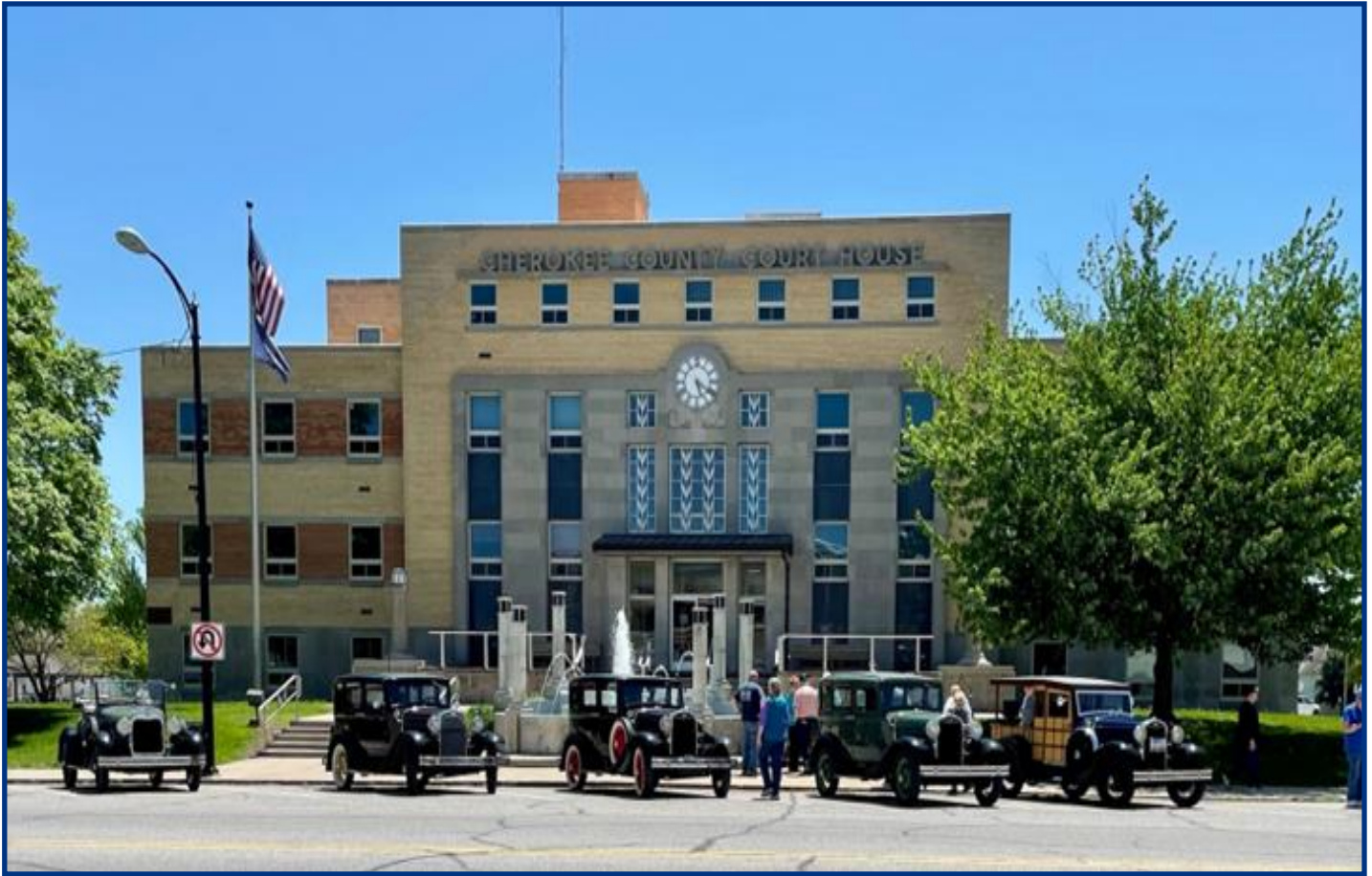
Cherokee County Court House: Model A's on tour with Seth Thomas clock giving up the time of day for our visit.

All of us are familiar with the infamous "Route 66." With only 11.27 miles of the famous highway passing through Kansas, it was imperative that we end our 2022 Big Kansas Road Trip by driving our Model A's on a portion of the highway that passed through Galena, Baxter Springs, Kansas and embrace the Route 66 spirit. We stopped briefly at a restored Kan-O-Tex filling station, dragged the main street in our Model A's and ended our Route 66 drive with a jaunt to Baxter Springs for a car show/arts & crafts fair.