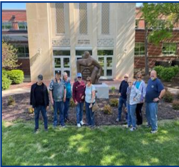
Wichita A's pose with Pitt State gorilla mascot.

Day three of our Big Kansas Road Trip found our cars motoring to Pittsburg State University to walk the campus grounds and tour the University Veteran Memorial Amphitheater. With the "gorilla" as the school's mascot, our Model A members availed themselves of the opportunity of a group photo with a gorilla.