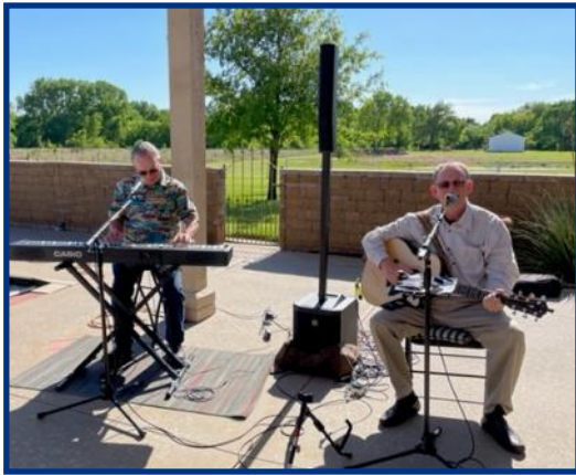
A surprise band! What fun!