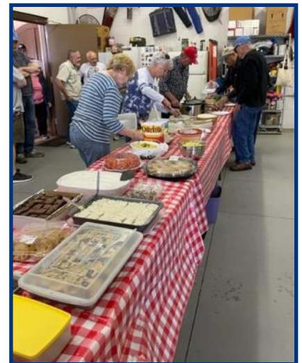
As usual, lots to eat when you gather the Model A group.