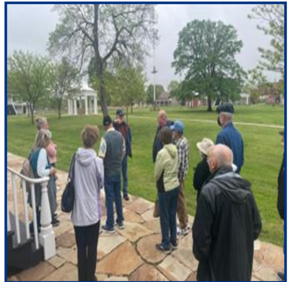
Wichita A's tour Fort Scott, Kansas

Day one found our group in Fort Scott for a visit to the Lowell Milken Center for Unsung Heroes. Our group learned of a Polish social worker, Irena Sendler who saved 2,500 Jewish children from certain death during World War II but went unrecognized until three girls from Uniontown, Kansas discovered her forgotten story. A moving tribute and a terrific museum where our group learned about extraordinary individuals who changed history yet were never recognized. Ft. Scott provided our group with a "Dolly the Trolley" 50 minute tour of historic Fort Scott and the National cemetery. We concluded day one with dinner at Dry Wood Creek Café located in one of the Victorian Lyons Twin Mansions built in 1872 for twin sisters