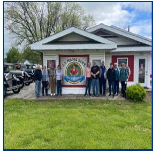
Lunch Stop in Arma, Kansas

The Big Kansas Road Trip is not only about the historical sites in our state, but also the chance to experience the mom/pop stores and dinners hidden in small towns. High noon found our party motoring to Arma, Kansas and dining at La Mama Bere's Mexican restaurant. La Mama Bere's provided great food as well as an opportunity to share Model A camaraderie.