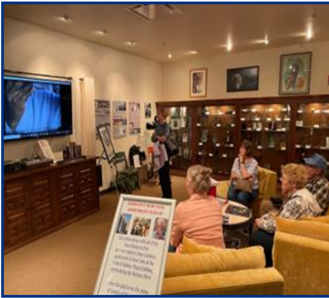
Wichita A's visit Gordon Parks Museum