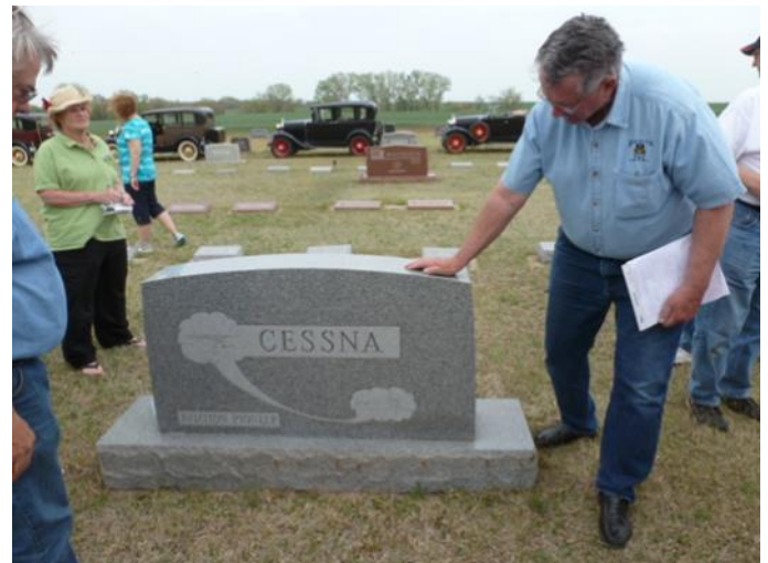
Cessna, Aviation Pioneer, buried near the family farm in Kingman, County