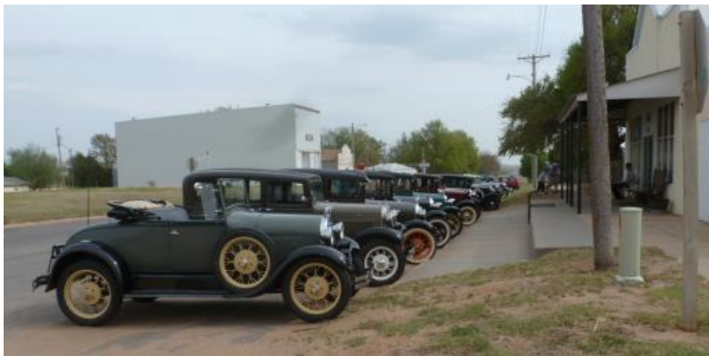
25 Model A's in front of The Lumber Yard Restaurant in Zenda.

There were a few problems with cars, including some flat tires. Points closing up and a timing gear failure that we heard of, but for the most part it was a very great shake down tour. RG