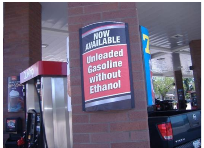
The pumps are identified with this sign on the end of the islands.