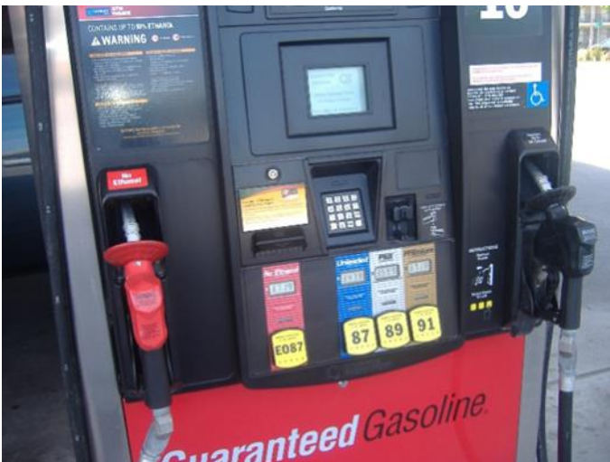
E087 Button marked, No Ethanol. Also, pump handle is red.