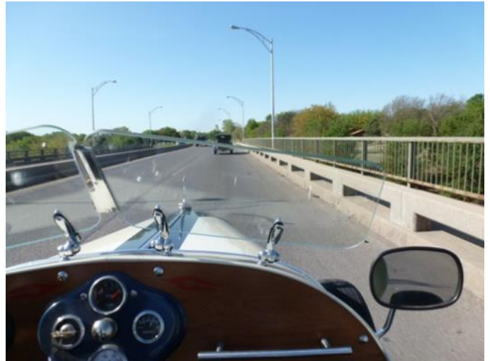
The view from a Speedster.

The weather was perfect. Don Grabendike did a wonderful job of putting this fun filled tour together.