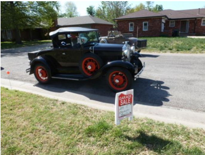
No, Randy's beautiful Roadster is not for sale!