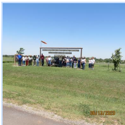
Wichita A's at Marion Lake Guinness World Record Site.

Completing our lunch the group headed out for one last mission in Marion. The A's participated in a round the lake car cruise and photo stop at the 2012 Guinness World Record Site where "1272 Marshmallows ere Roasted Simultaneously." With a successful picture moment to document our travels, the Wichita A's proved once again small town America and oddities in life make some of the most interesting stops.