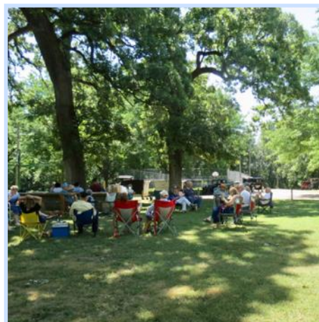
Wichita A's Picnic in the park Marion, KS- June 13, 2020KS

Refreshed and energized from our Peabody visit the group restarted their Model A's for the final leg to Marion, Kansas city park. Reaching the Park, the group set up lawn chairs and enjoyed a bierock sack lunch from CB Bakery. Featuring made from scratch, fresh bierock and chocolate chip cookie desert, the picnic provided a great forum for our group to socialize outdoors and maintain social distancing in this time of Covid 19 pandemic.