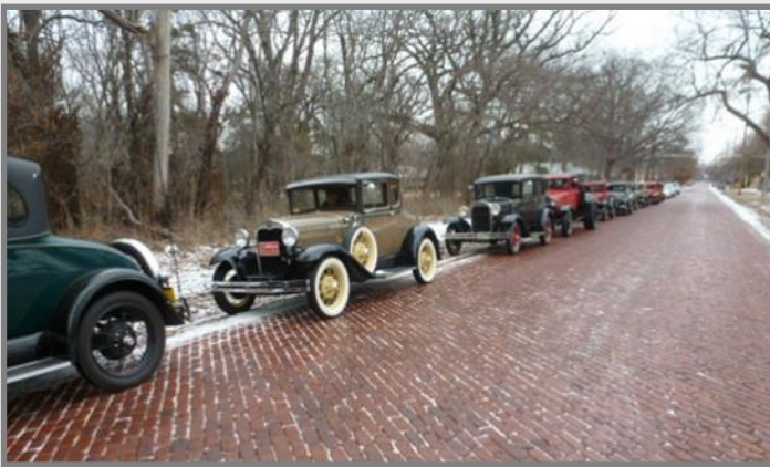
Twenty two Model A's were driven on this tour.