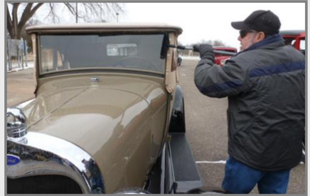
A little freezing rain happened during the tour.