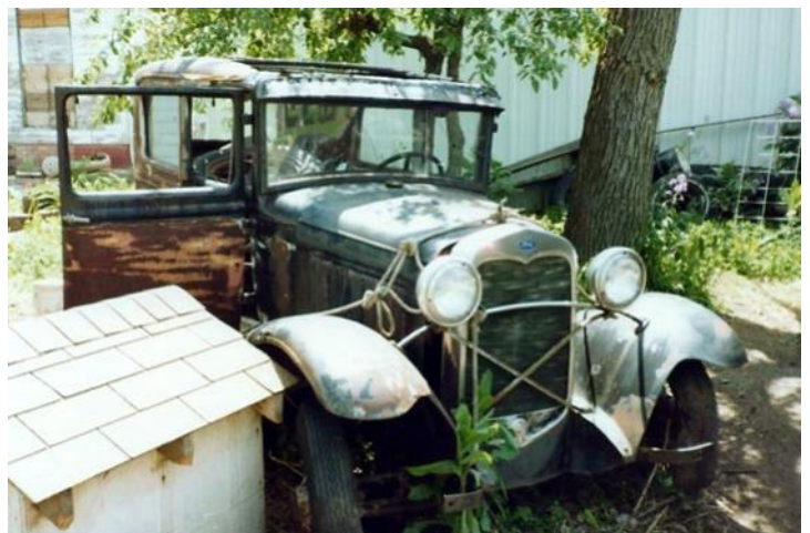
Steve's 30 Model A after resting in a shelter belt for over 20 years.