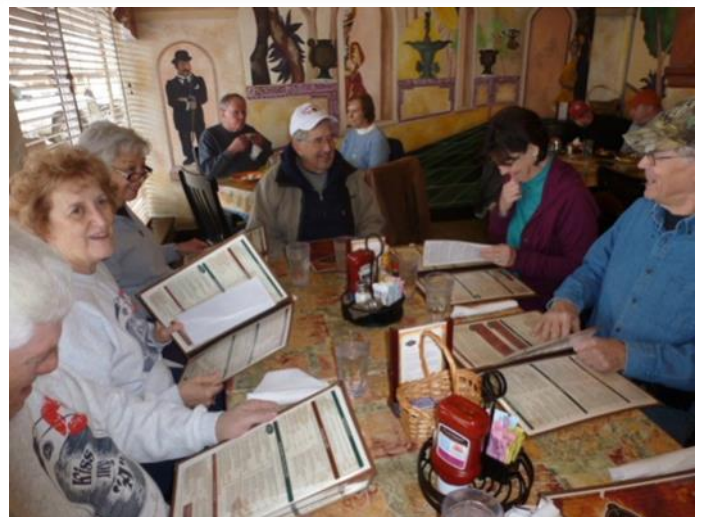
Over flow of club members went to another restaurant.