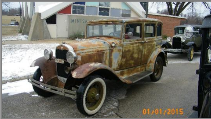
Guess who's Model A showed up on the tour!