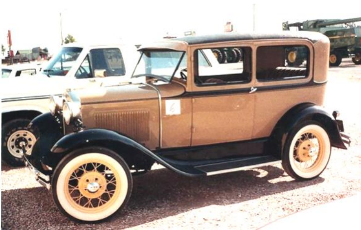
Same Model A after 1st restoration in the eighties.